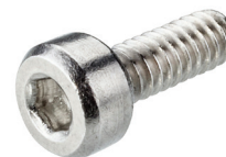
G125-4520000B 5mm Hex Socket Bolt