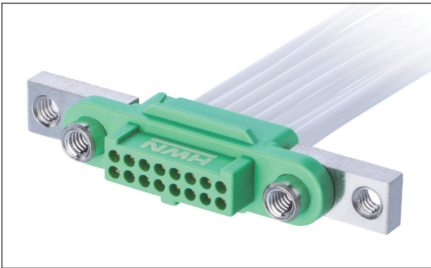
Gecko-SL female cable assembly