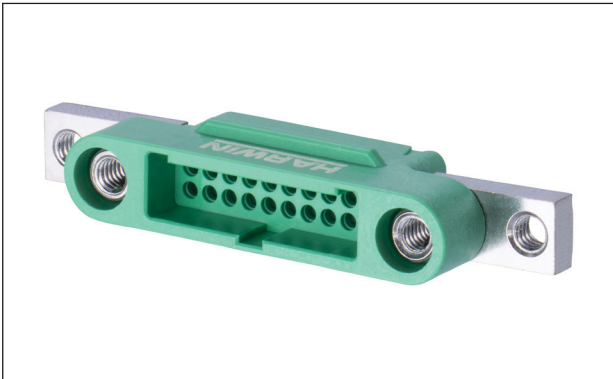
Gecko-SL male cable housing, 20 contact