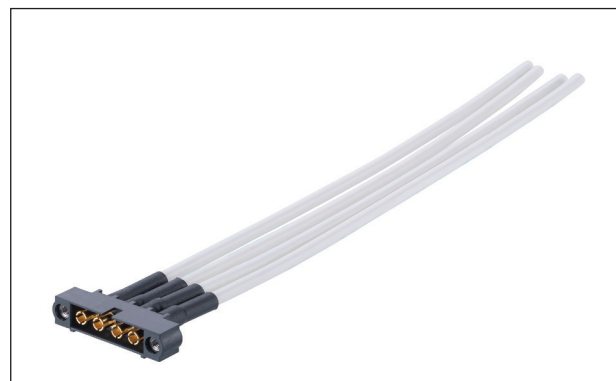
Datamate Power single ended male cable assembly