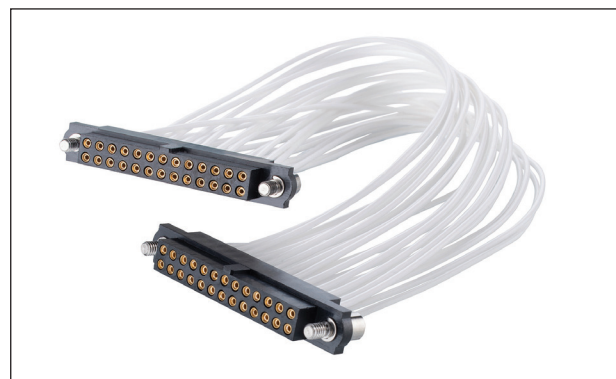
Datamate J-Tek double-ended female cable assembly

Ideal for prototyping, small builds, or higher volume production, these cable assemblies are stocked in standard lengths – 150mm across the range, with additional 300mm and 450mm options (6", 12" and 18"). Built using high quality PTFE-insulated cables and performance connectors from the high-reliability Datamate range, these ready-made harnesses are ready for your extreme environment applications.