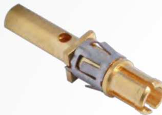
Crimp 18, 20 AWG