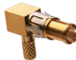
90°Male Ø2mm, Ø2.7mm

Coax contacts come in two sizes - Ø2mm are compatible with RG178 coax cables, Ø2.7mm with RG174/RG179/RG316, and Semi-rigid with UTO47: