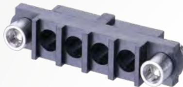
Female Hex Socket Jackscrews 2, 3, 4, 6 or 8 contacts