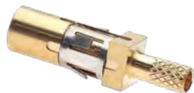
Female Ø2mm, Ø2.7mm