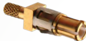
Male Ø2mm, Ø2.7mm