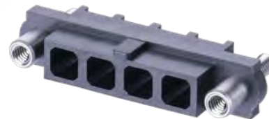
Female Internal Thread, Front Panel Mount 2, 3, 4, 6 or 8 contacts

Reverse fix flips the floating jackscrew onto the male connector, and the female connector now has the internal thread.