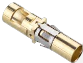
Solder 12, 14, 16 AWG