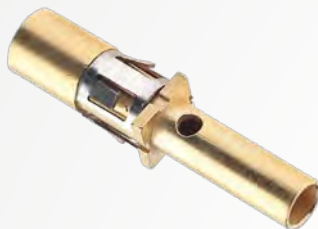
Crimp 18, 20 AWG