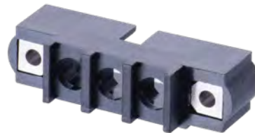
Male 101Lok receptacle 2, 3, 4, 6 or 8 contacts

By using a bayonet fixing instead of a threaded jackscrew design, mating time is significantly reduced. The 101Lok style allows the connectors to be fully mated, then each fixing is engaged with a simple push-and-turn action. The bayonet fixing is fitted to the female connector, with the receptacle fitted to the male.