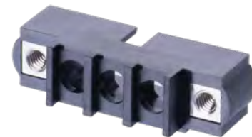
Male Internal Thread Jackscrews 2, 3, 4, 6 or 8 contacts

Standard Gender jackscrews are often used when the male connector is on the PCB. Male connectors are fitted with an internally threaded jackscrew, and the female jackscrew is externally threaded and the jacking half (usually called floating). The female floating jackscrews are free to move and screw into the male jackscrew. The choice of heads gives the option for screwdrivers or hex drives (such as Allen keys).