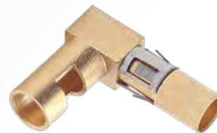
90° Solder 12, 14, 16 AWG