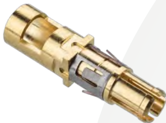
Solder 12, 14, 16 AWG