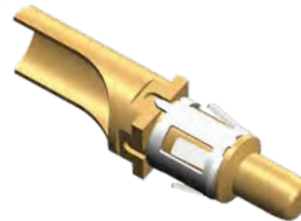
Solder 10 AWG

For the male connector a full range of straight power contacts are available, capable of carrying 5A at 20AWG to 40A at 10AWG: