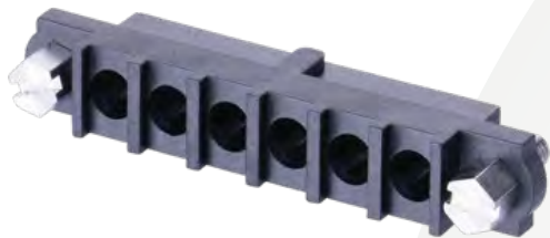
Female Hex Slotted Jackscrews 2, 3, 4, 6, 8 or 10 contacts