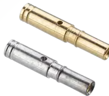
Extra Small Bore 28-32 AWG

Contact faces for signal crimps are always gold – however, on the female contacts there is a choice of outer shell finish, either gold or tin. The tin is 100% tin over a nickel undercoat to avoid tin whisker issues.