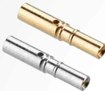
Small Bore 24-28 AWG