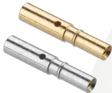
Large Bore 22 AWG