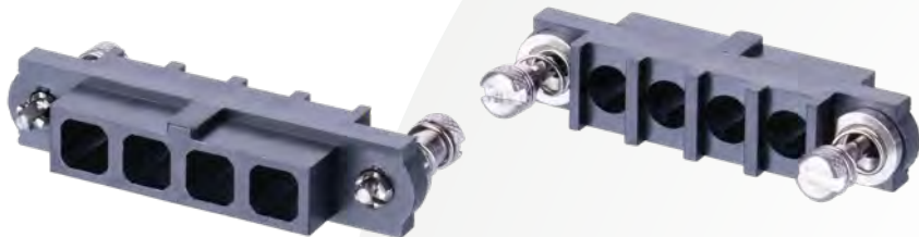
Female 101Lok 2, 3, 4, 6 or 8 contacts