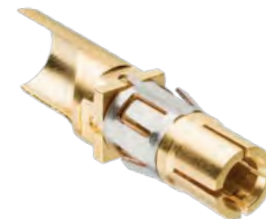
Solder 10 AWG

For the female connector a full range of power contacts are available, capable of carrying 5A at 20AWG to 40A at 10AWG: