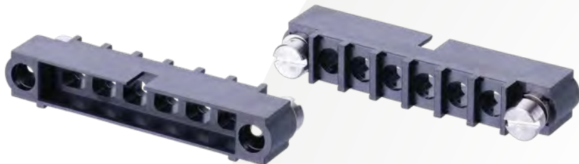
Male Slotted Jackscrews 2, 3, 4, 6 or 8 contacts